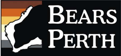
Bears Perth Current Age Distribution